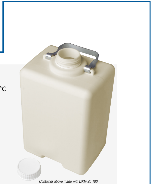
Container above made with DMX-SL 100.